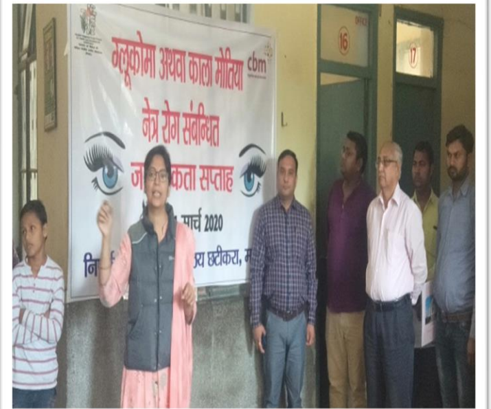
Awareness on Glaucoma Day